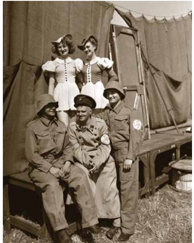
ABOVE RIGHT: Toronto comedians Frank Shuster (bottom left) and Johnny Wayne (bottom right) enlisted in the Canadian Army in 1941, and performed at home and overseas.